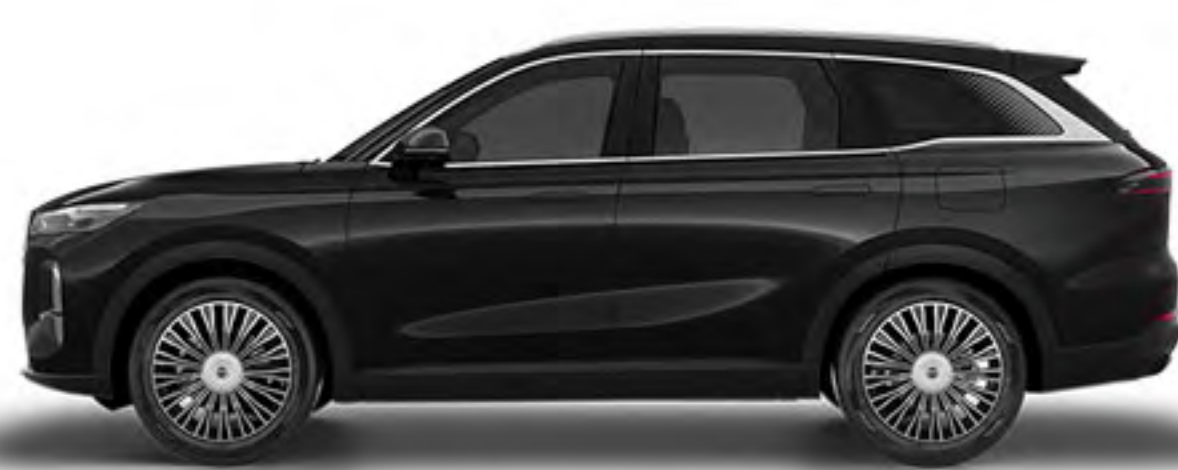
Pine Ink Black