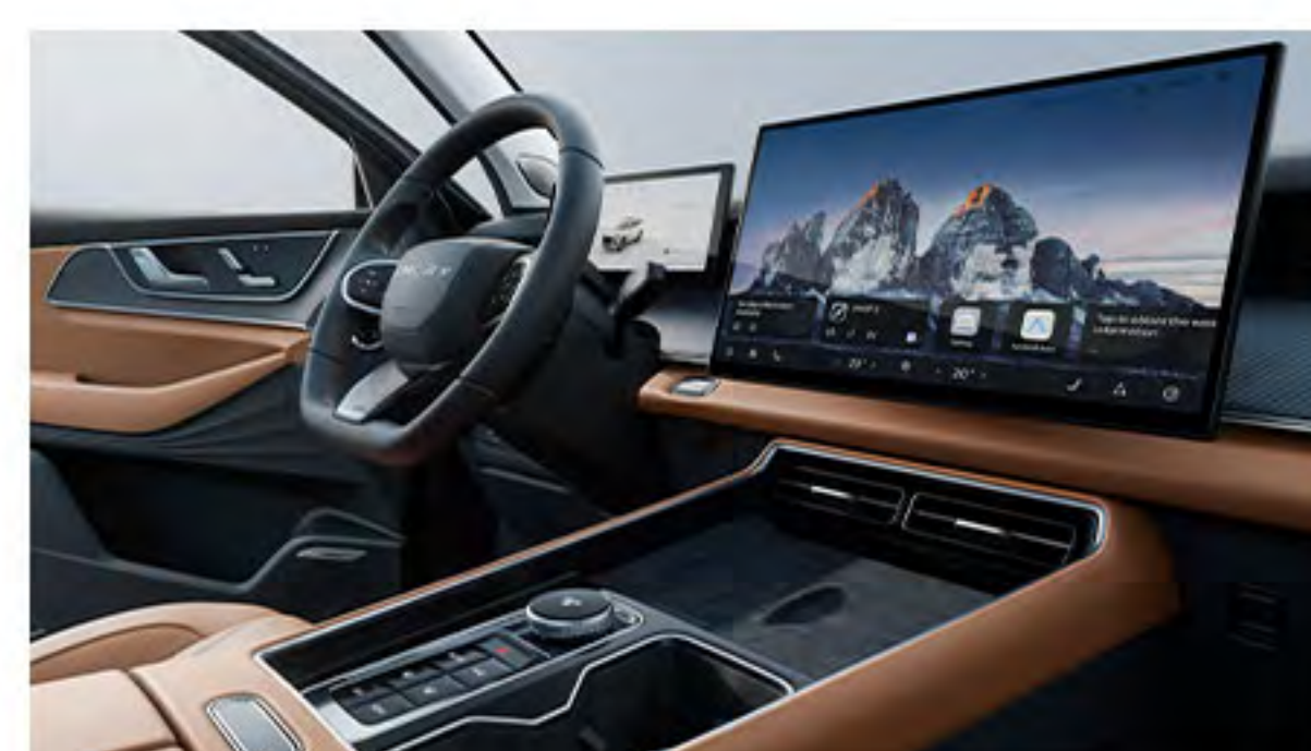
15.6" HD-Screen & 50W High Power Wireless Phone Charger