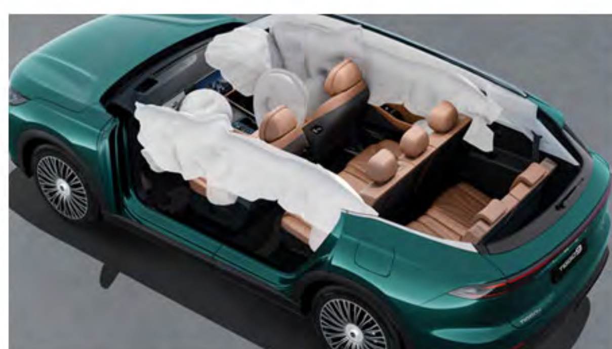
10 Safety Wraparound Airbags