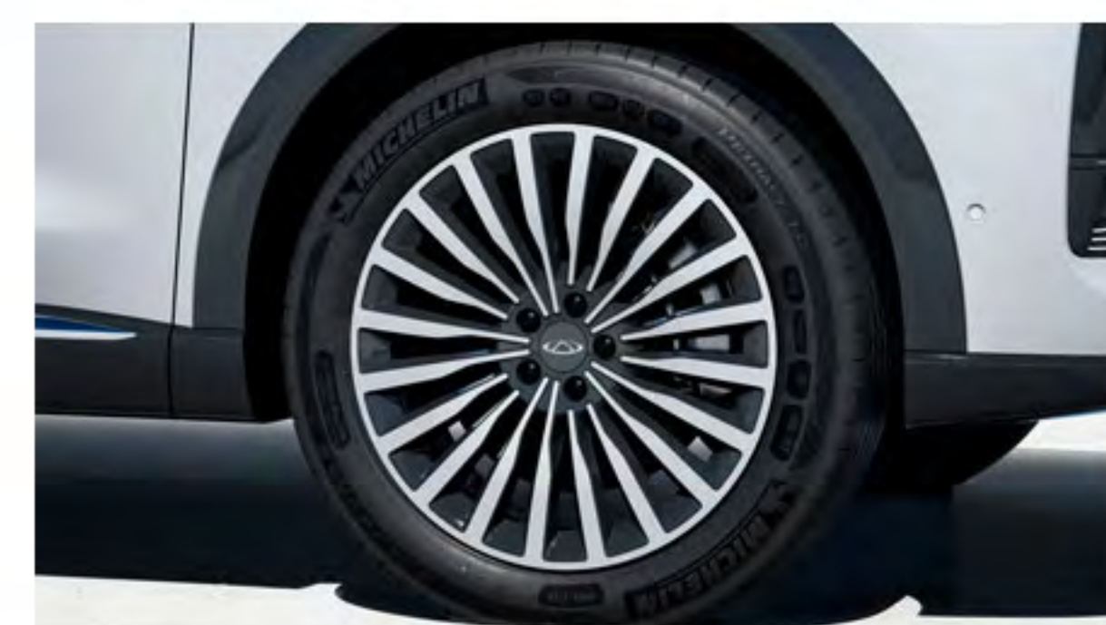
20 Inch Alloy Wheels w/ Kumho Tires